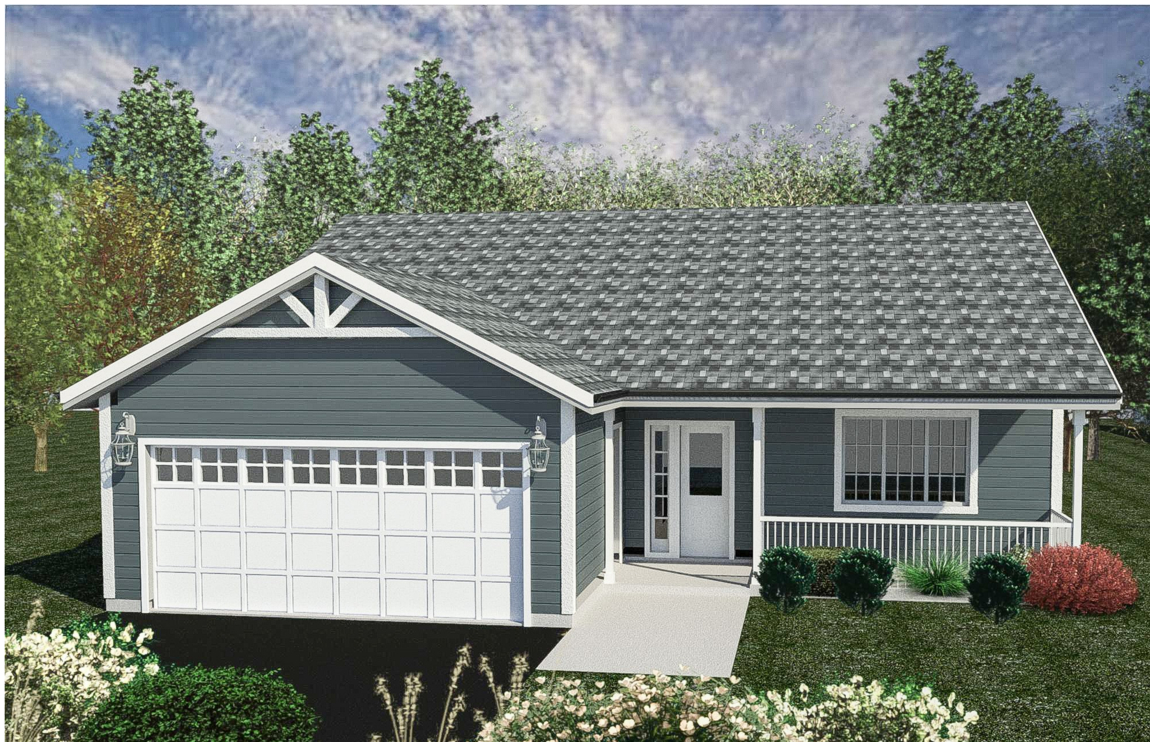
The Balsam - Elevation B