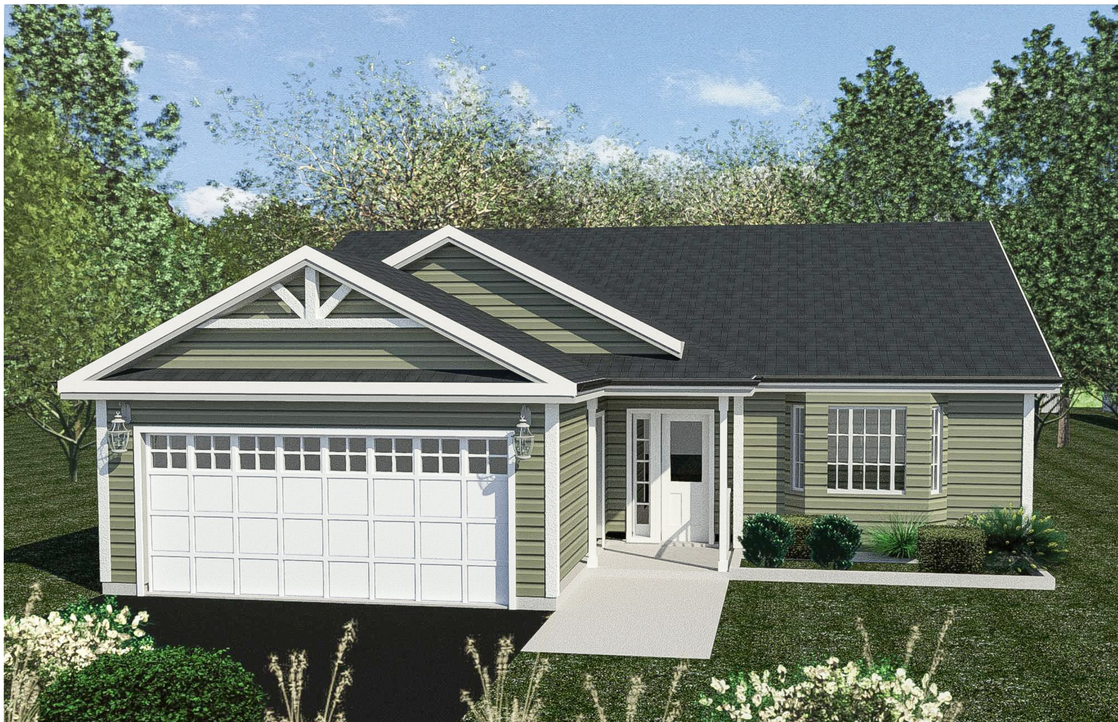
The Balsam - Elevation A