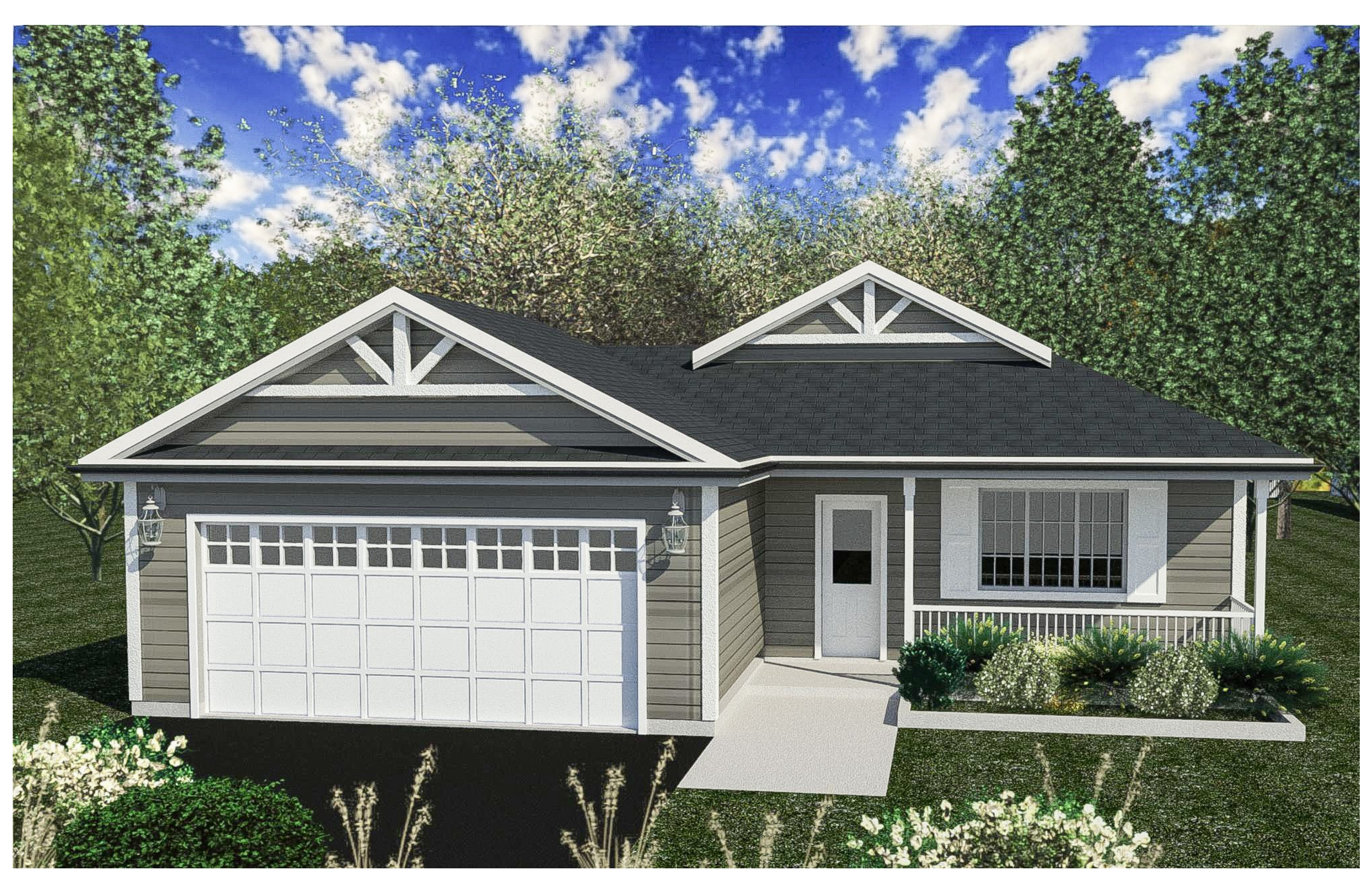
The Severn - Elevation A