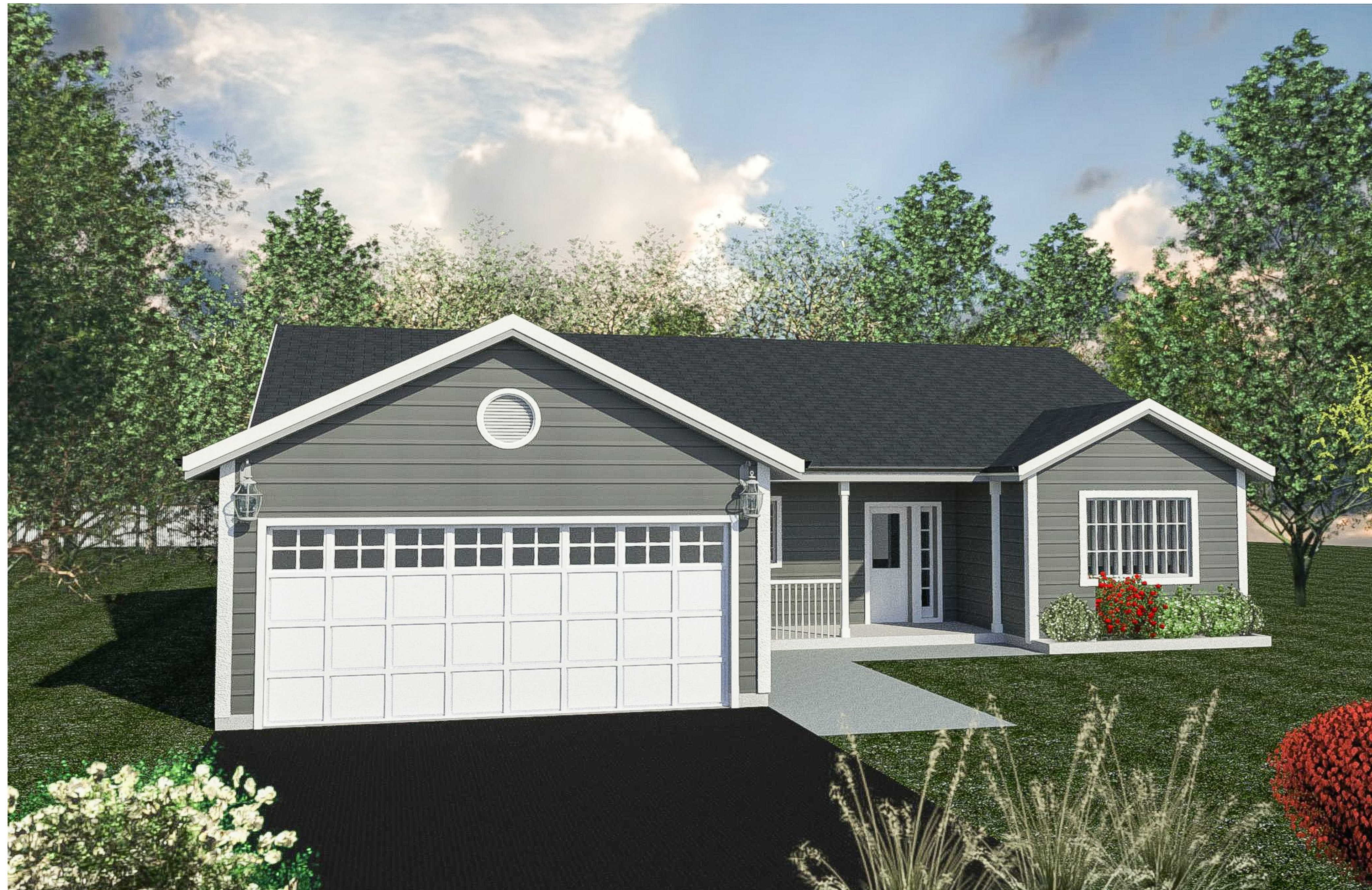
The Trent - Elevation A