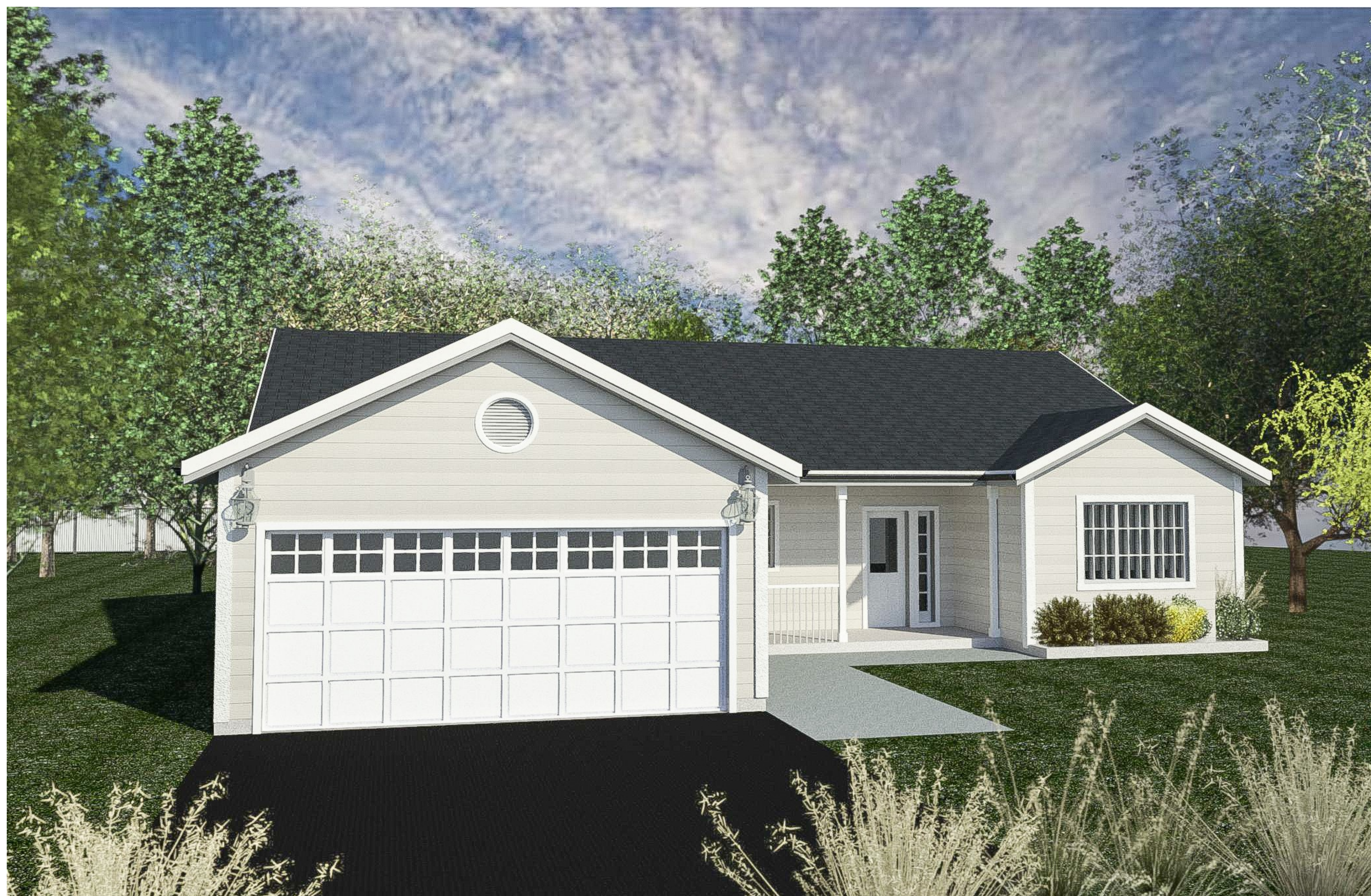
The Trent - Elevation B